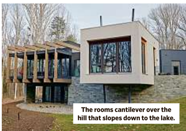
The rooms cantilever over the hill that slopes down to the lake.