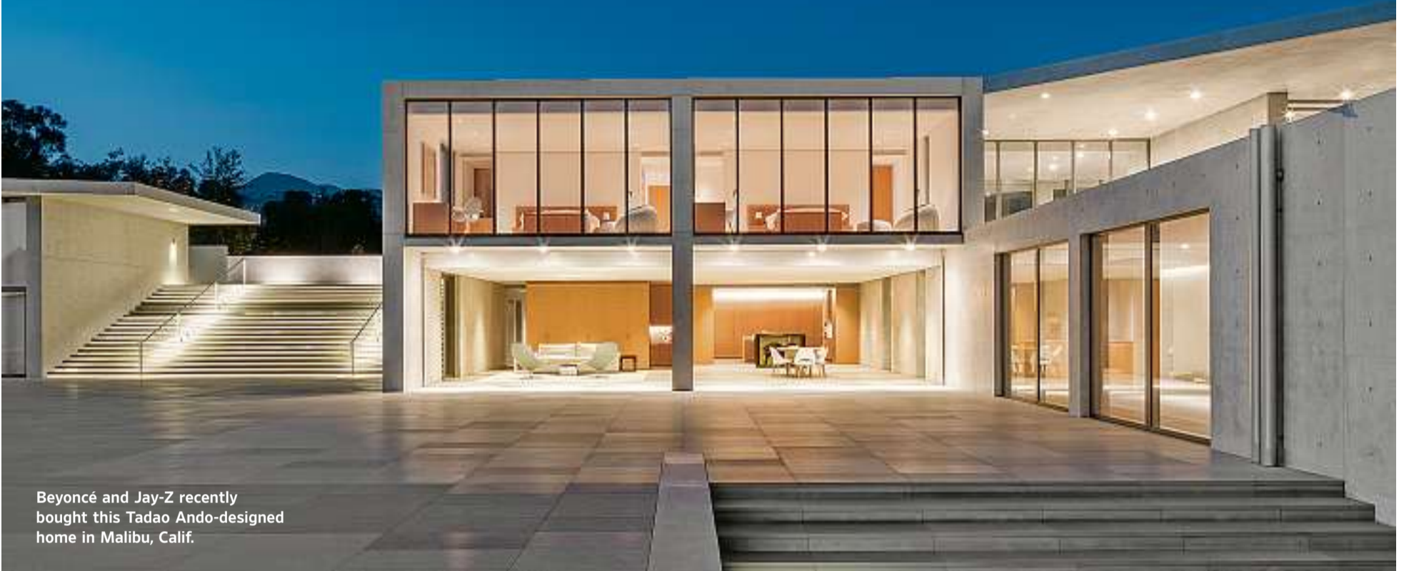
Beyoncé and Jay-Z recently bought this Tadao Ando-designed home in Malibu, Calif.

The 81-year-old Japanese architect Tadao Ando has developed a cult following among the likes of Beyoncé, Jay-Z, Kanye West and Kim Kardashian. 'It was like working with God.'