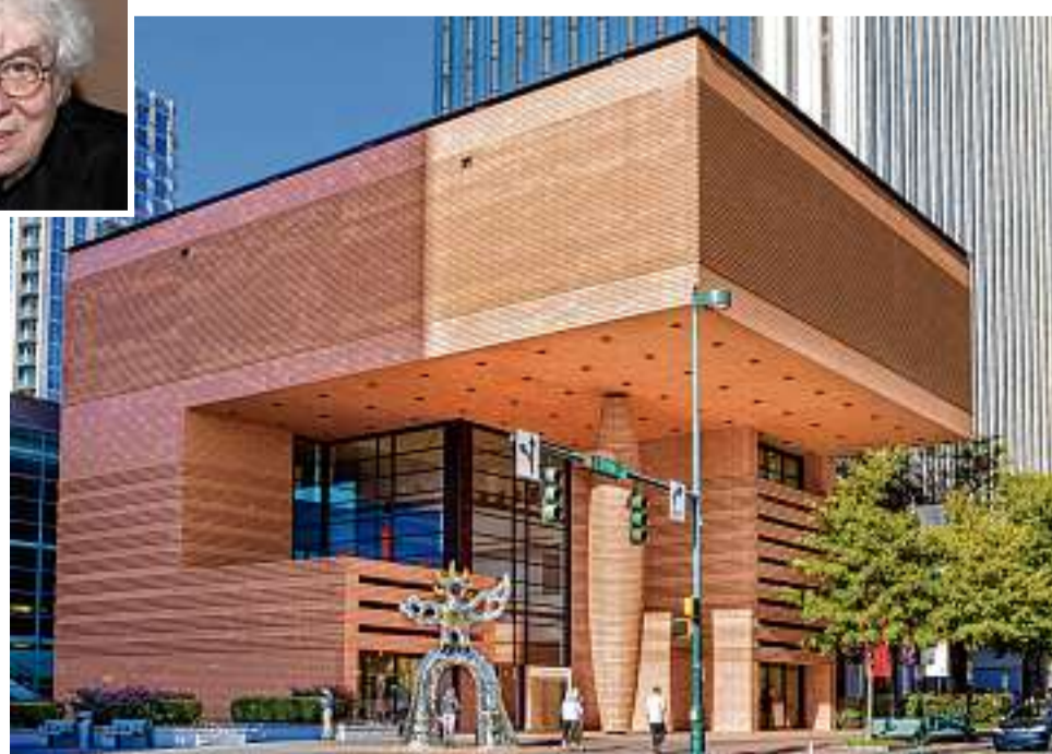
An inspiration for the house was the Bechtler Museum of Modern Art, designed by Swiss architect Mario Botta, above.

ing as balustrades. A main room with 14-foot ceilings holds the kitchen, dining and living rooms. At one end is a balcony with a porch overlooking the lake.