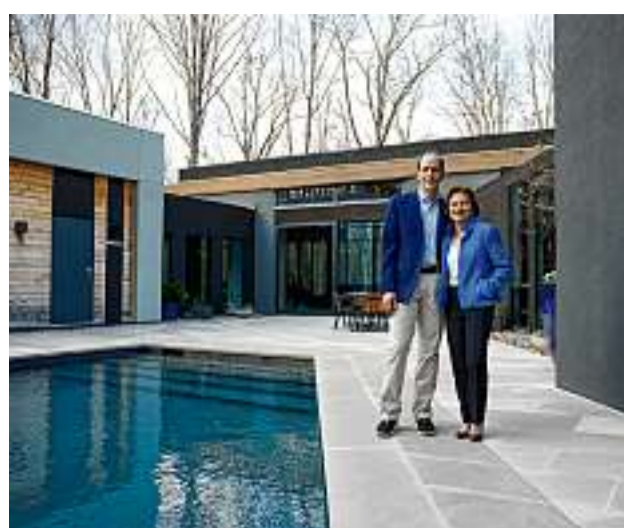
The design for the couple's three-bedroom, four-bathroom house was approved because it fit within its surroundings; it is set on top of stone walls carved into the hill.