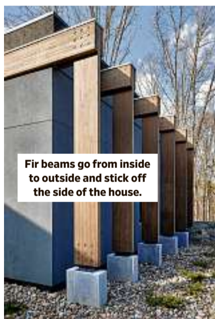
Fir beams go from inside to outside and stick off the side of the house.